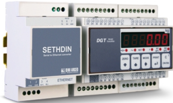
SETHDIN: Example of installation with DGT4