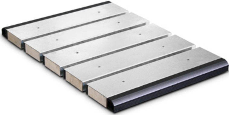
Levelling module WWSLM