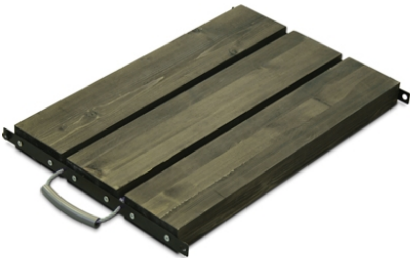
Wood levelling module WWSW