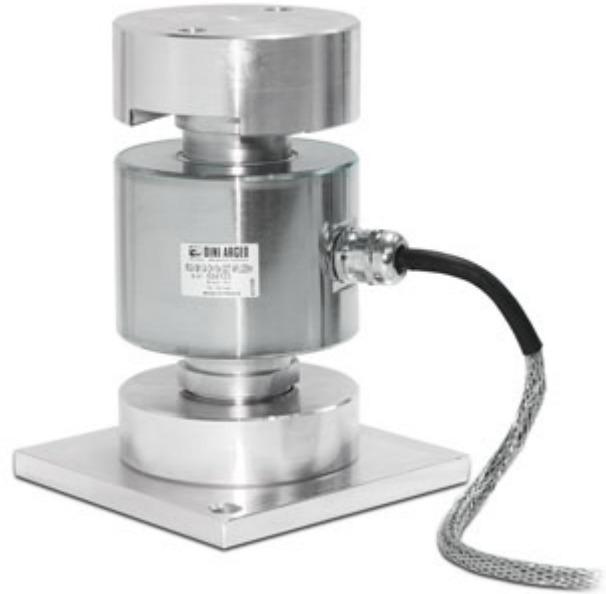
RCD load cell complete with optional KRCA kit.